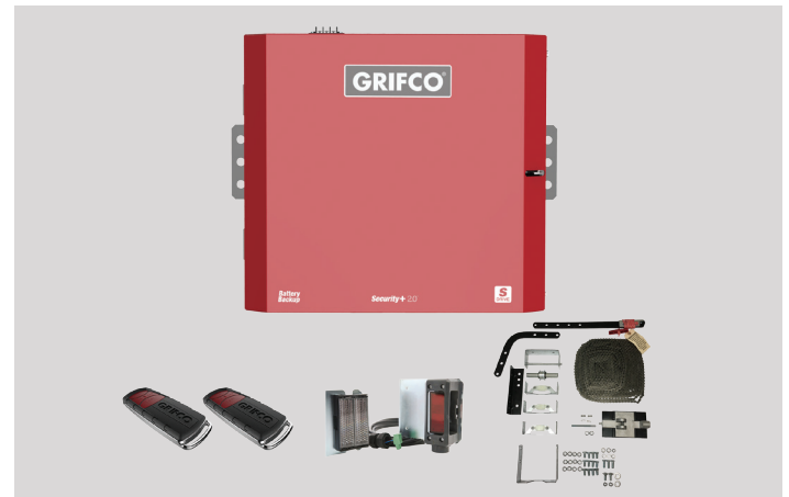
Product may differ slightly from image shown.

Commercial Door Operators / Sectional Door Operator / S-Drive