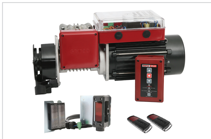
Product may differ slightly from image shown.